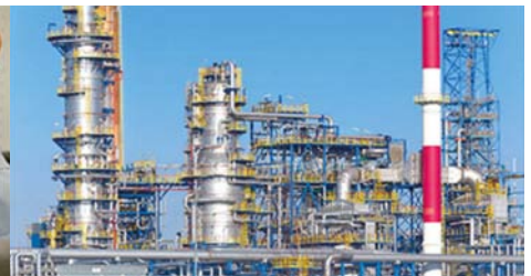
Plant Design Software

CADMATIC Marine Design Software is a versatile software tool for engineering ships of all sizes and complexity, offshore constructions, and machinery in 3D. CADMATIC Marine Design Software consists of various modules for Hull and Outfitting, but also includes special marine modules for creating shell plates, plate nesting and NC data for automated welding and profile cutting. The 3D model acts as an information database throughout the entire lifecycle of the marine investment.