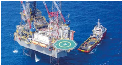
Marine Design Software

a good reputation of having one of the world's best money/performance ratios. The software solution for your engineering work is a carefully chosen combination of our software products and modules introduced below. Contact us and let us show you the CADMATIC way to boost your performance.